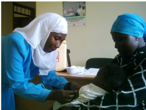
An immunisation session