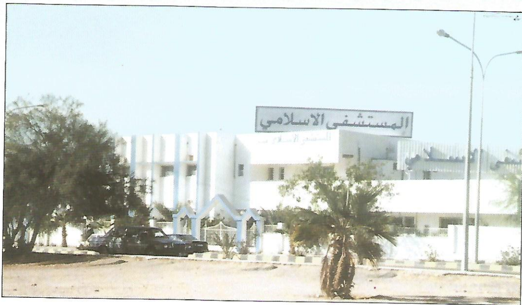
THE ISLAMIC HOSPITAL IN AQABA

The hospital was organized along the same lines of distinguished medical and ethical standards as the mother Islamic Hospital in the Capital Amman.